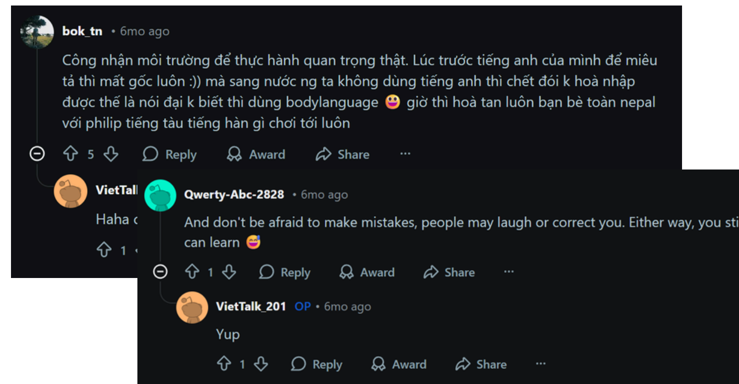
Figure: Vietnamese people discuss their English speaking experience